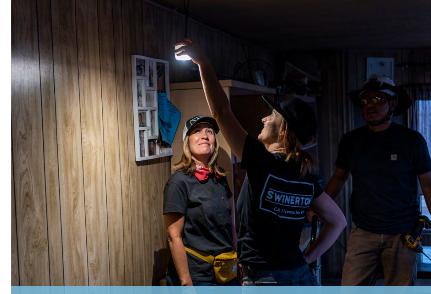
BRINGING LIGHT TO THE NAVAJO NATION

"After my visit, I felt such an overwhelming sense of pride in what we do and how we can directly help so many folks less fortunate than us through a single light. I can't wait to get back and start our Lightmakers Project."